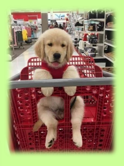
I am ready, just in case .....